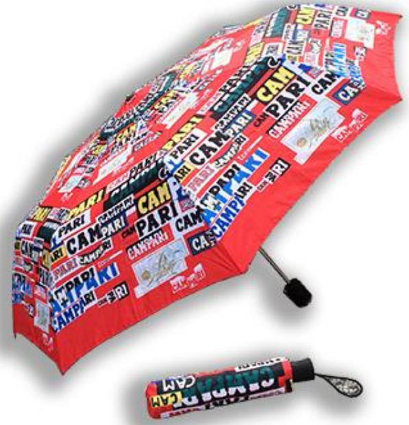
MINI UMBRELLA CAMPARI