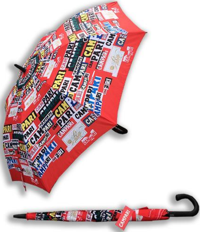
GOLF UMBRELLA CAMPARI