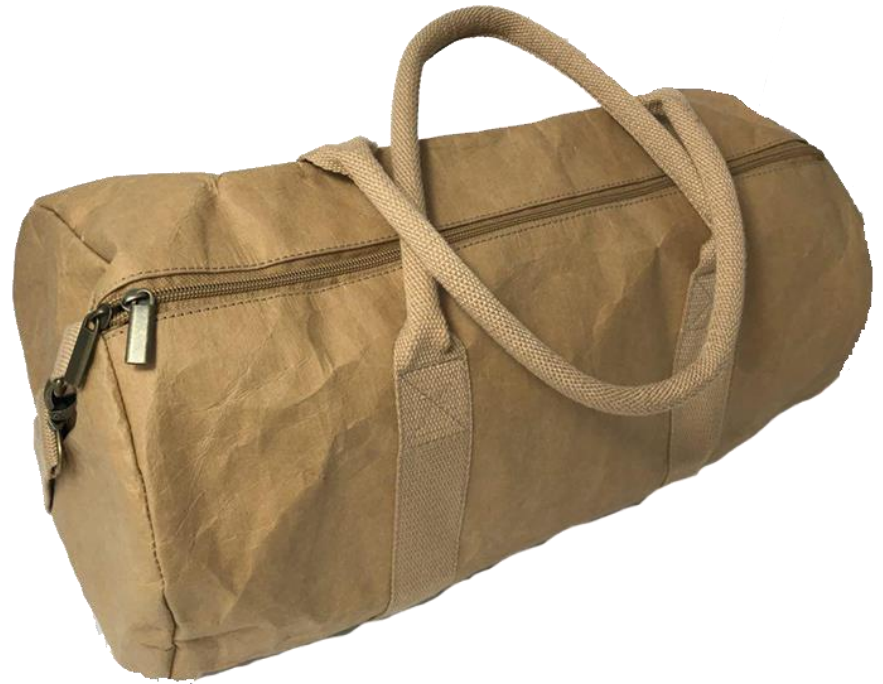
LA GAZZA LADRA