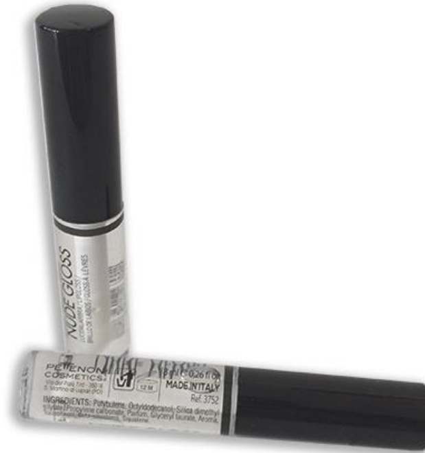
Lip Gloss ALTEREGO