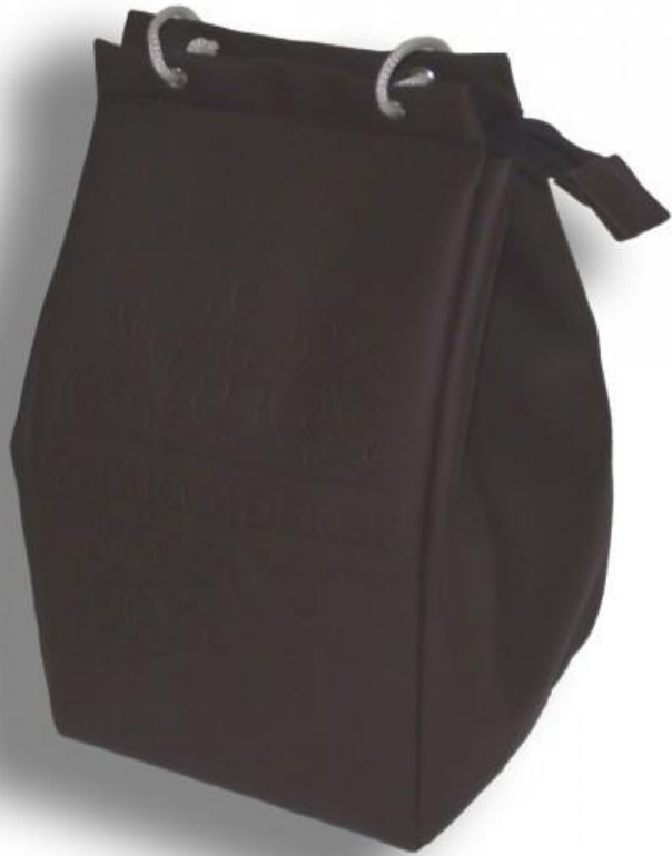
elegant cooler bag