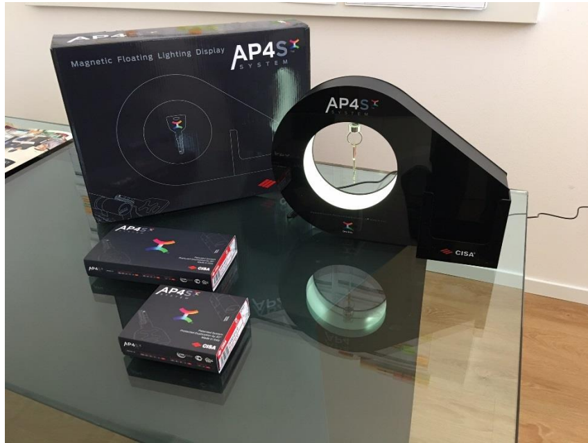
CISA Magnetic Floating Display