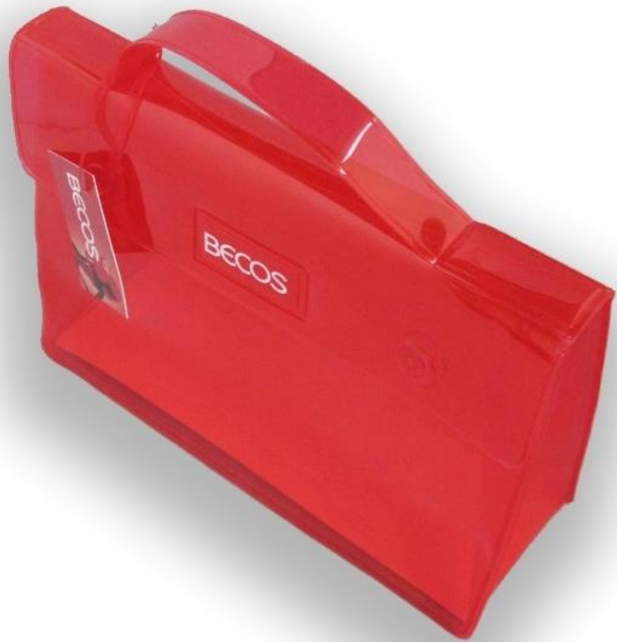
The PVC Pochette Becos