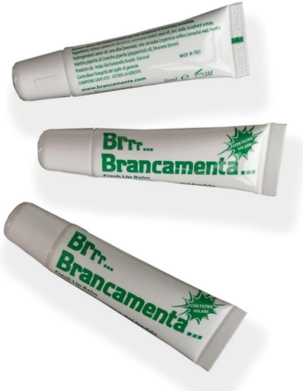
UV Reactive Lib Balm BRANCA MENTA