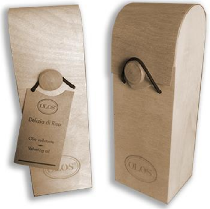
OLOS: Wood Box