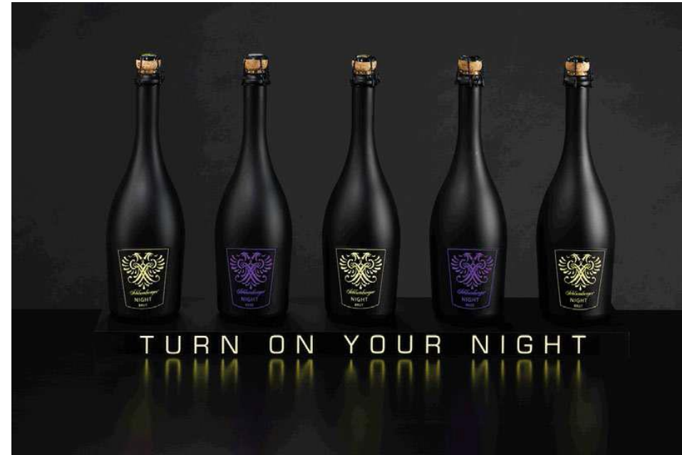
SCHLUMBERGER Night Display with Luminous Labels