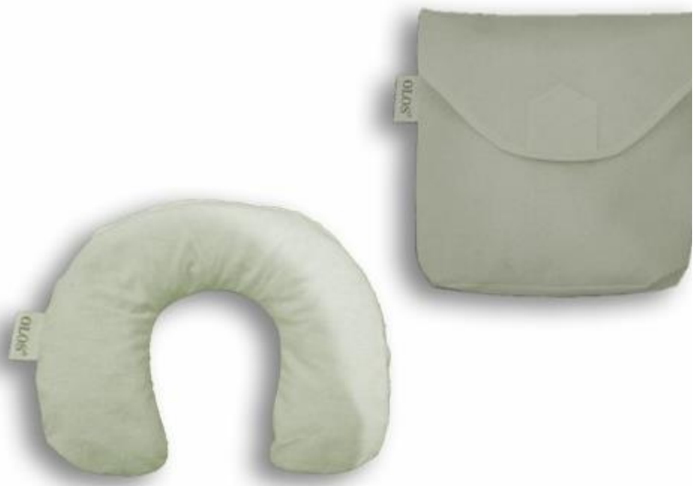
OLOS: Cherry Stone Pillow