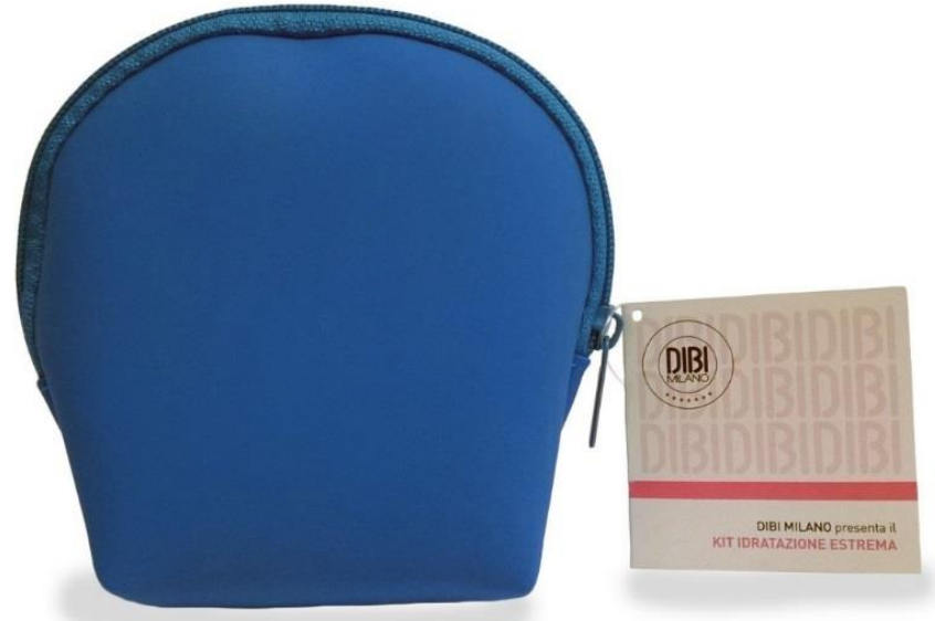
The Silicon Pochette DIBI