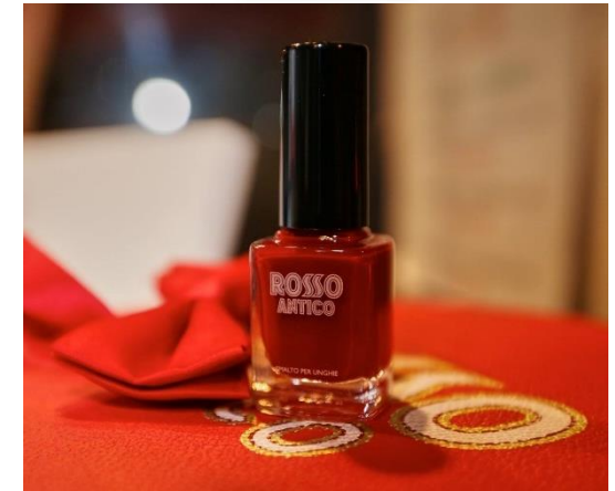
Nail Polish ROSSO ANTICO